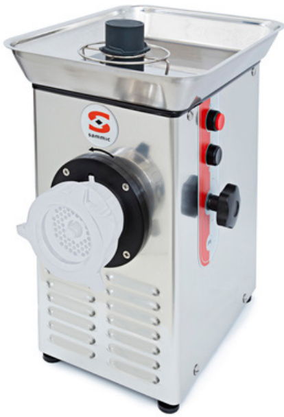
Plate diameter: 82 mm Inlet mouth diameter (1) : 60 mm Refrigerated mincer: no Electrical supply: 230 V / 50 Hz / 1 ~ (5 A) Plug: EU (SCHUKO 2P+G)